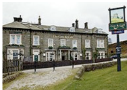
Cow & Calf, Ilkley