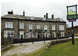
Cow & Calf, Ilkley