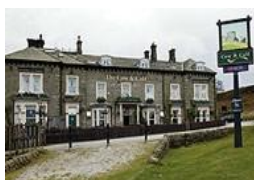
Cow & Calf, Ilkley