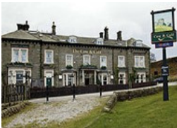
Cow & Calf, Ilkley